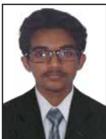
SECHAN B.L. Comp. Science-100